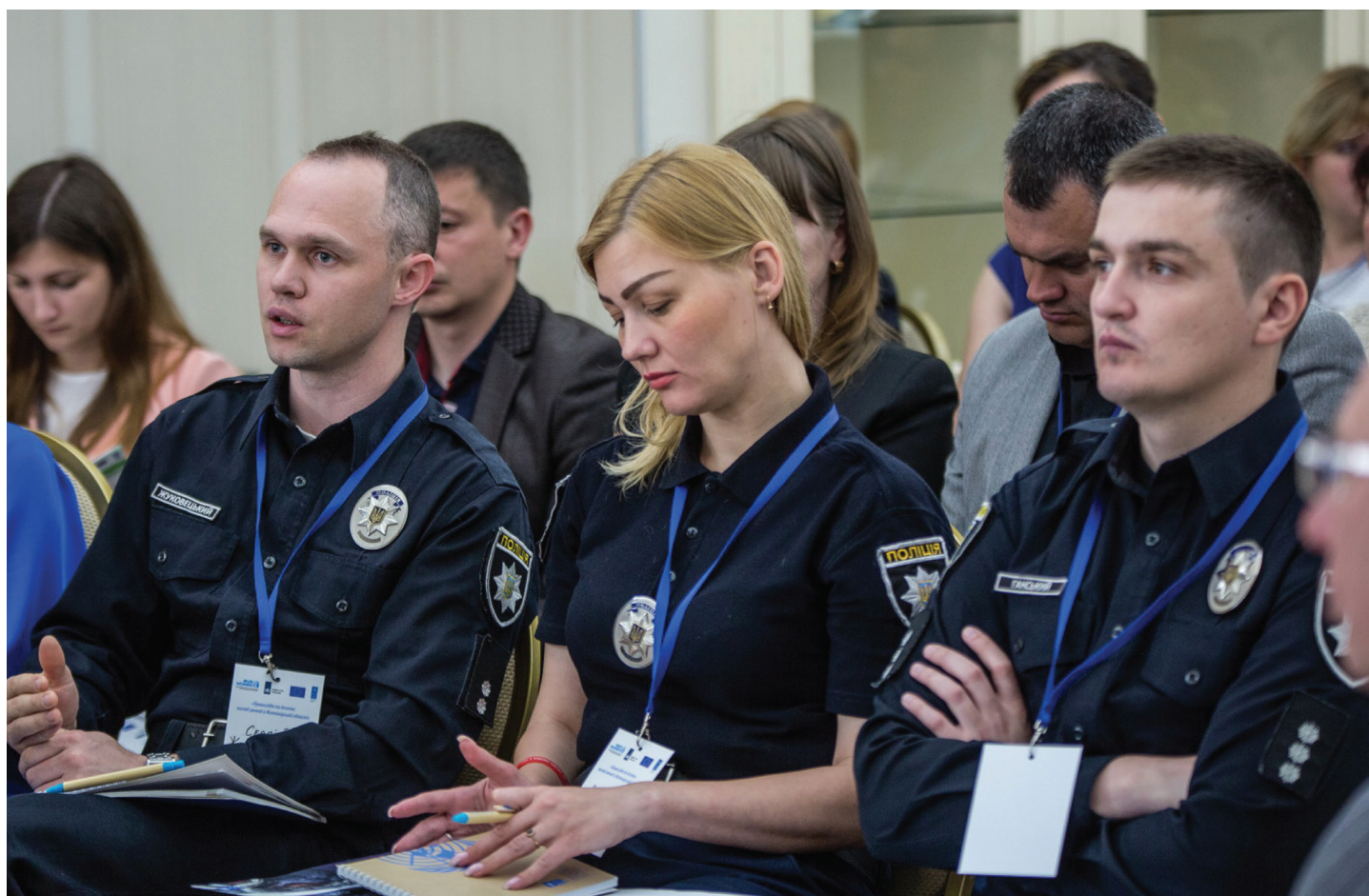
Conference on community security and justice, 25-27 May 2017, Zhytomyr

To address the aforementioned critical challenges the UNDP has implemented the “Rule of Law and Community Justice for Conflict-Affected Areas in Ukraine” project that was financially supported by the Government of the Netherlands. The project’s key objective lied in strengthening the protection of human security and rule of law in conflict-affected oblasts of Ukraine, addressing the consequences and underlying causes of the conflict.