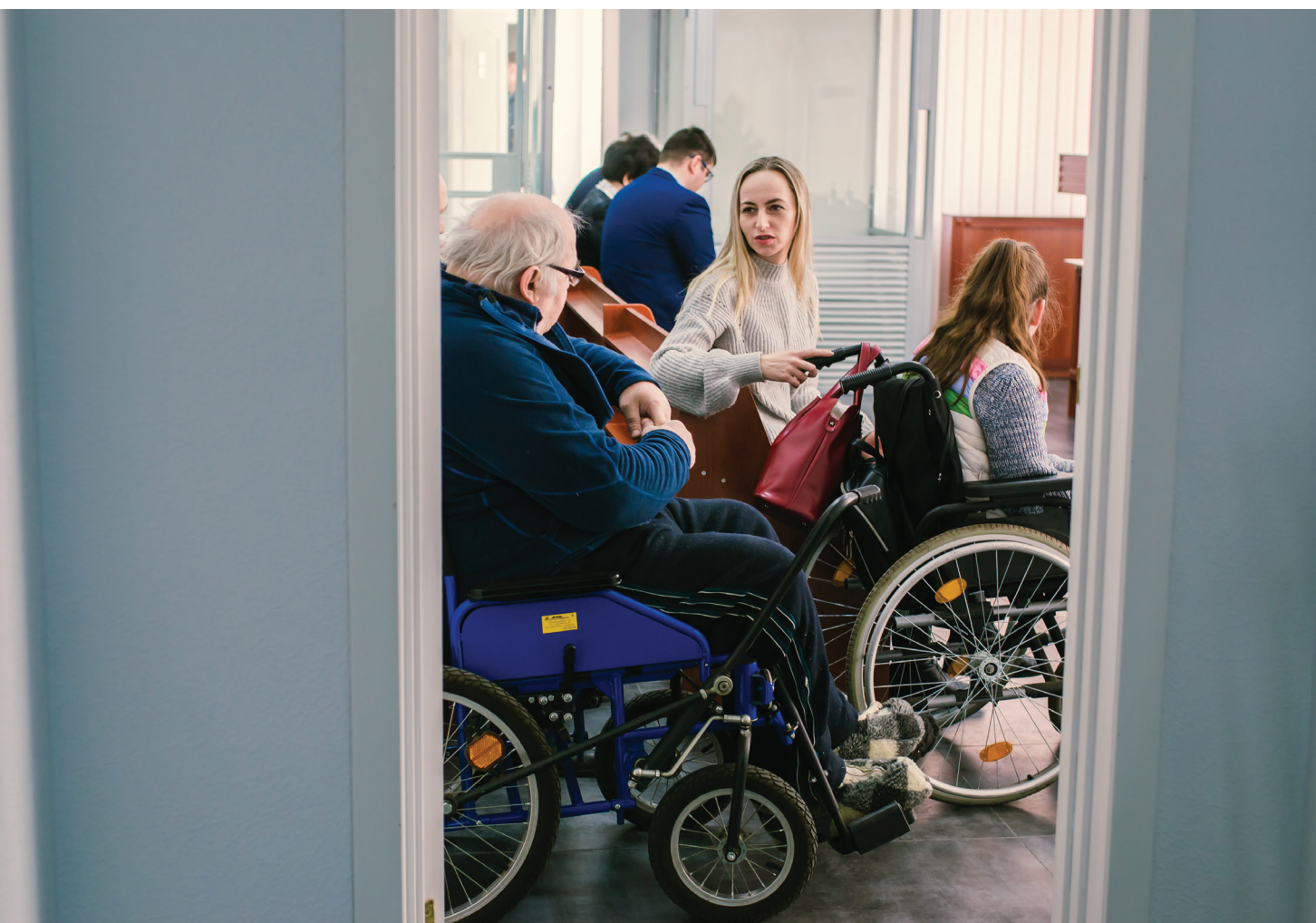
Reconstructed Vuhledar City Court, Donetsk Oblast

Based on these findings, the district courts in Vuhledar, Donetsk Oblast, and Novopskov, Luhansk Oblast, have been redesigned to improve accessibility for persons with disabilities and parents with children. All venues for visitors have been renovated to create an improved client-oriented environment. Moreover, police stations in Druzhkivka and Lysychansk (Donetsk and Luhansk oblasts respectively) have also been renovated in line with universal design principles and are equipped with ramps and required furniture.