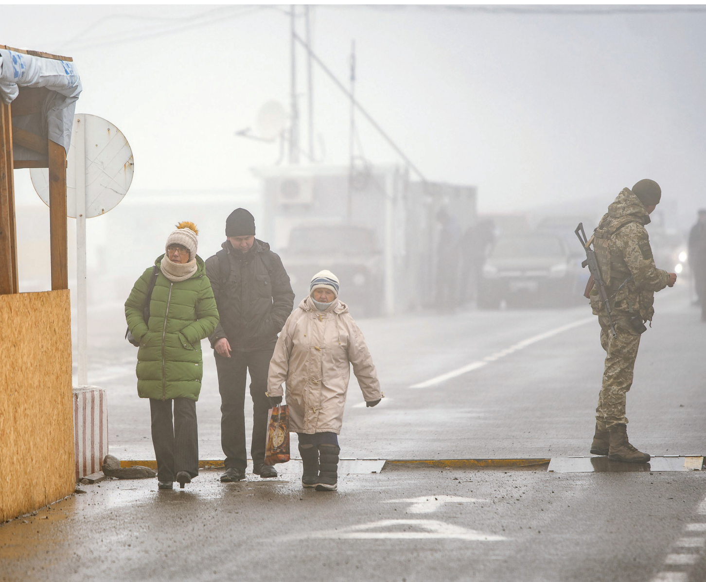
People at the Novotroitske entry/exit checkpoint, Donetsk Oblast

In strengthening access to justice, series of efforts were also undertaken in the area of reducing physical obstacles to justice-service delivery . In this context, the project conducted thorough accessibility assessment of court buildings in Donetsk and Luhansk oblasts. 5 The report provided an in-depth data on the courts’ accessibility, assessing them against relevant national and international legal framework and is also accompanied by recommendations as well as financial calculations needed to improve existing conditions. Based