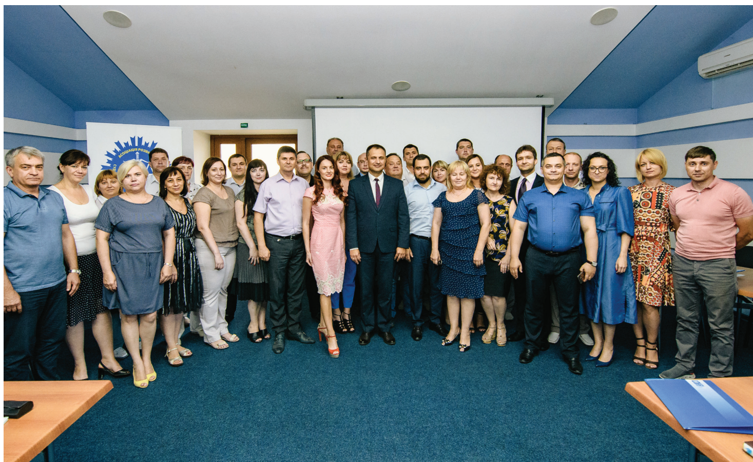
1 st Forum of Judges of Donetsk and Luhansk oblasts, 20-22 June 2018, Sviatohirsk

In line with these findings and the needs assessment of the communities, the project applied community security approach, aimed at enhancing capacities and empowering communities, local authorities, law enforcement and justice institutions to work together to find common local solutions to the faced securi-