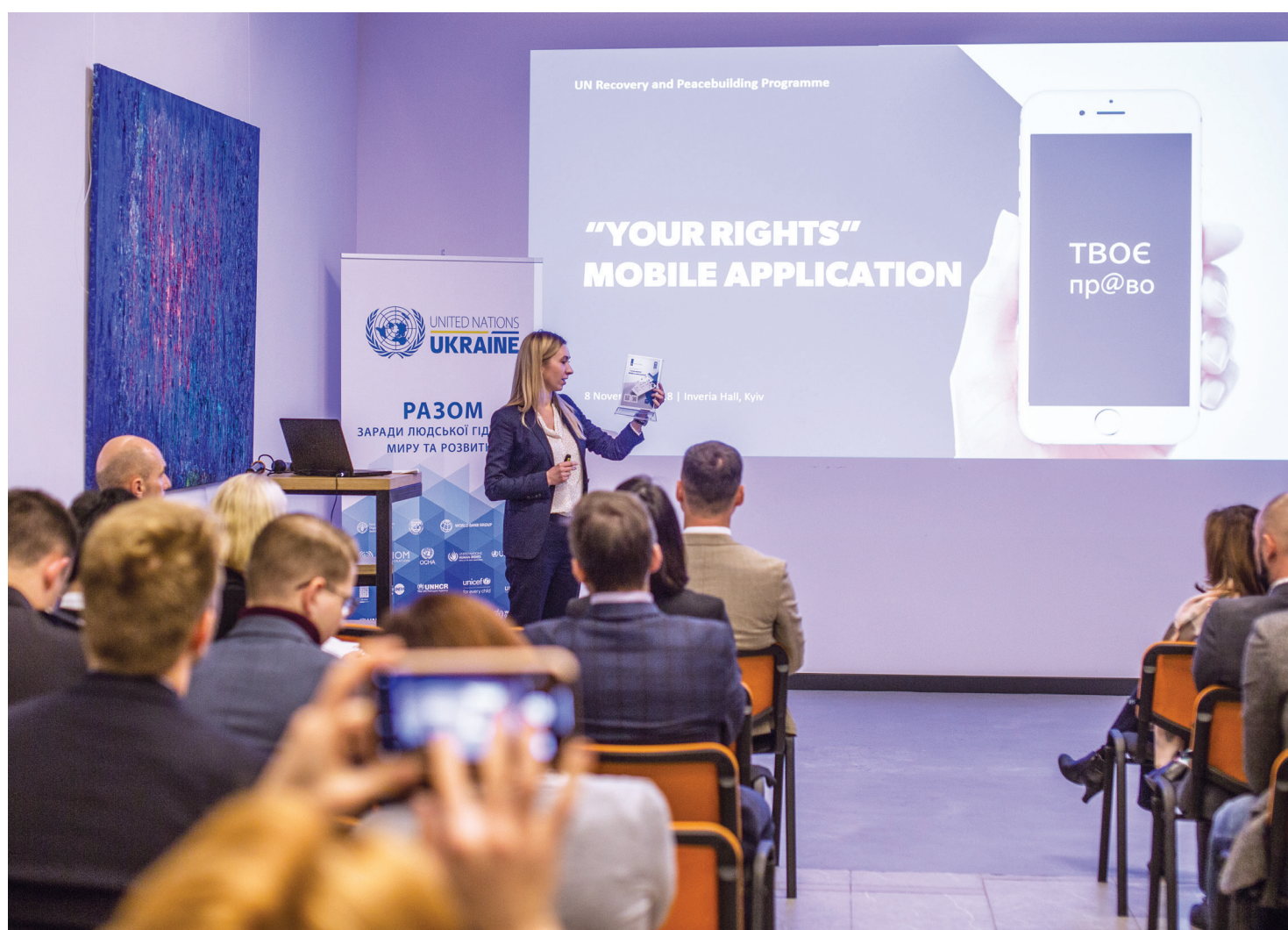
Presentation of “Your Rights” Mobile Application, 8 November 2018, Kyiv

accessible, but respondents from poorer households believed justice to be reserved for the rich and powerful. This perception of the justice sector not serving the needs of all persons equally is worrisome and underlines an urgent need for further reforms. The survey has also revealed public's low level of knowledge on the availability of the free legal aid services showcased by the fact that most of the respondents who even knew about secondary legal aid believed that they would be required to pay the government lawyer and did not have much confidence that their interests would be represented as well as by a private lawyer. Importantly, respondents have also expressed concern about whether they would understand court procedures, and in some oblasts felt they would not know how to start a case, underscoring a clear need